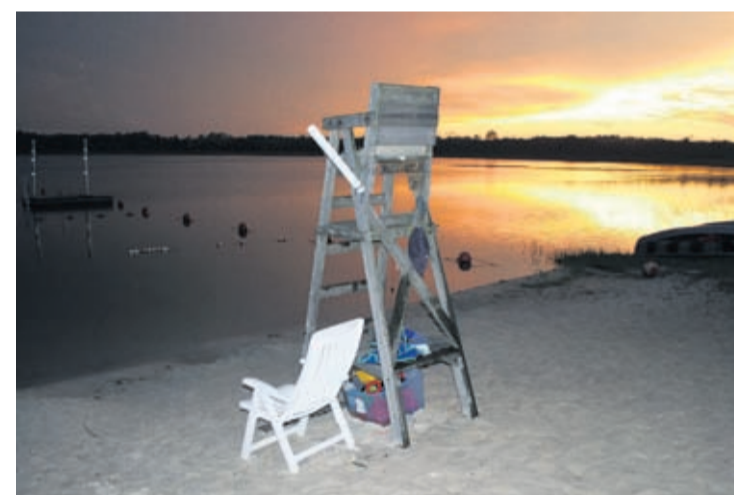
In this undated photo released by Camp Kiwanis, a lifeguard chair stands as the sun sets on Mill Dam Lake in the Ocala National Forest, where Camp Kiwanis has hosted local children since 1948 near Ocala, Fla.

Other camps are shutting down completely. Administrators in Florida realized it was impossible to practice proper social distancing at Camp Kiwanis, a sleep-away camp tucked along a lake in the Ocala National Forest. Each week, over 100 kids spend four nights and then go back to their homes in Marion County, which is seeing new coro-